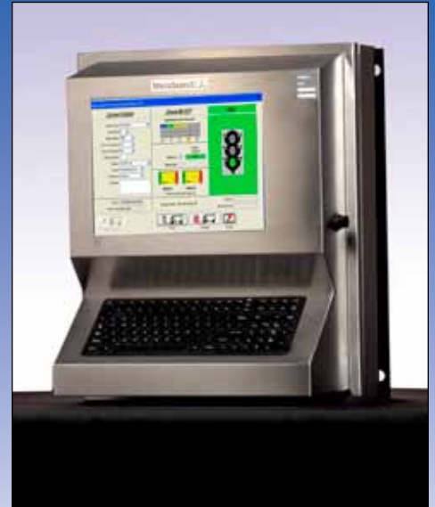
MicroSearch G3 industrial workstation.