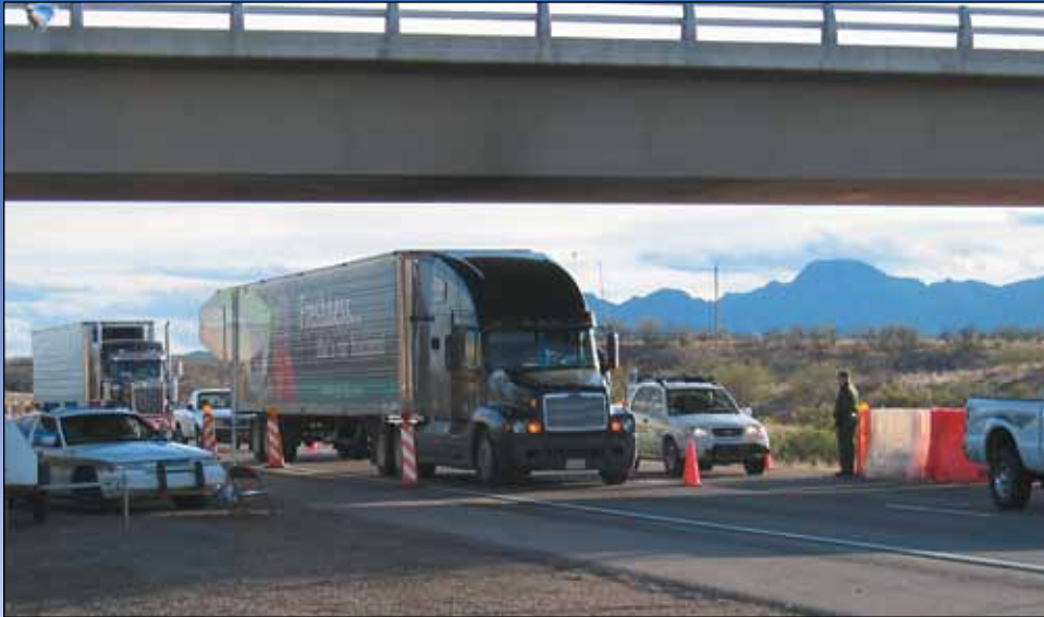
MicroSearch® G3 detects unauthorized individuals hiding in vehicles and containers.